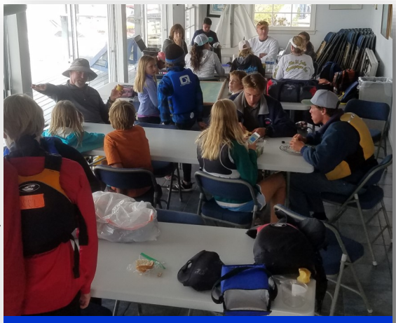
The club is packed at lunch time with juniors and sailing students

contains two of my favorite MBYC sailing events. First up is the Daysail-