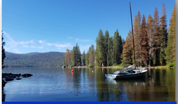
One lonely DS waiting in the cove for the rest of the boats to come

contains two of my favorite MBYC sailing events. First up is the Daysail-