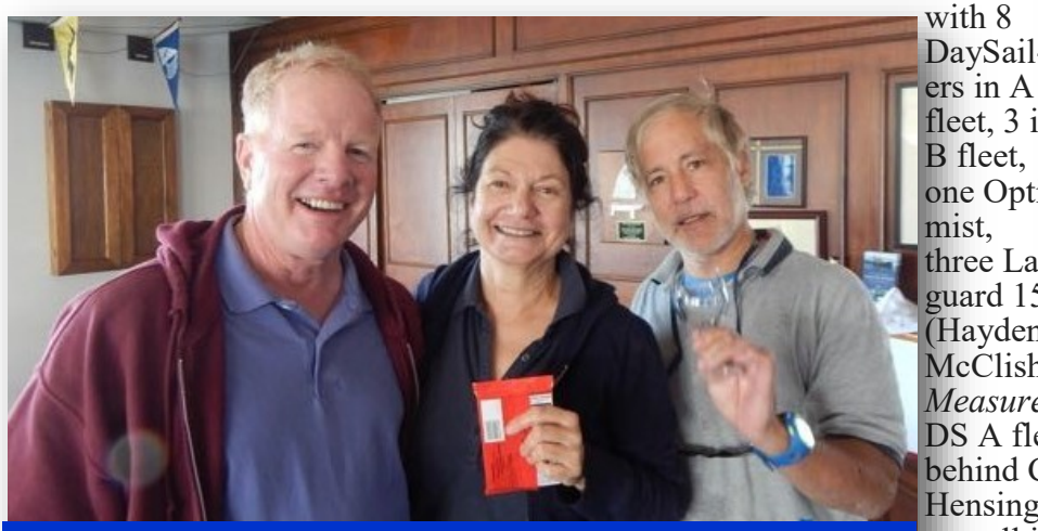
Summer I "in the money" crews and PRO

The club was well represented at the High Sierra Regatta - Weekend 1 , with 8