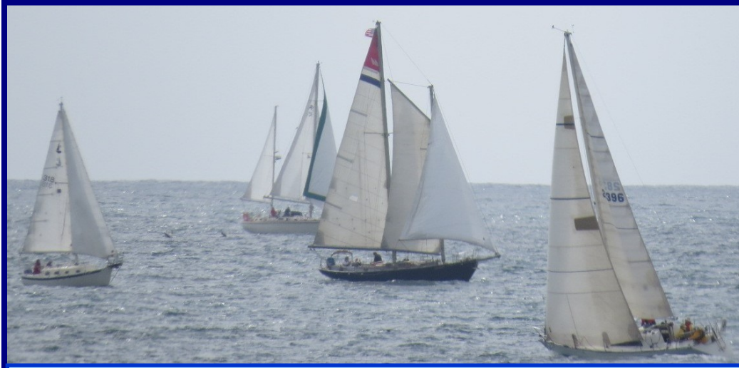
Four of the eight ocean boats from the Feb 22 Ocean Fleet Winter II race