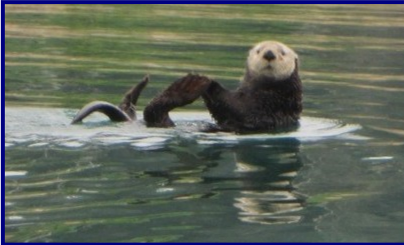
This otter joined us in our fun float this week. He performed his latest back stroke and floated in the tide with us.