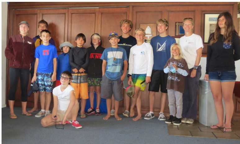
<<<< MBYC Junior Sailors - They are all winners!