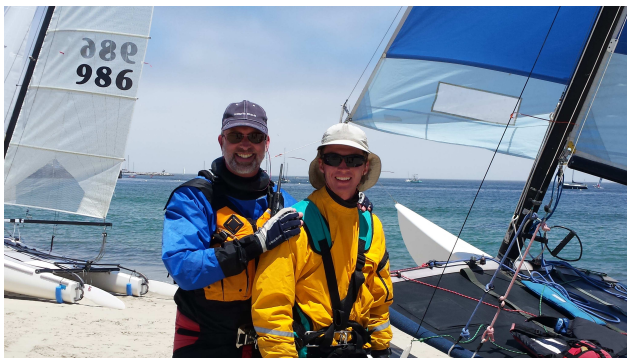
<<<Looks a little colder and wetter in Monterey Bay than Huntington.