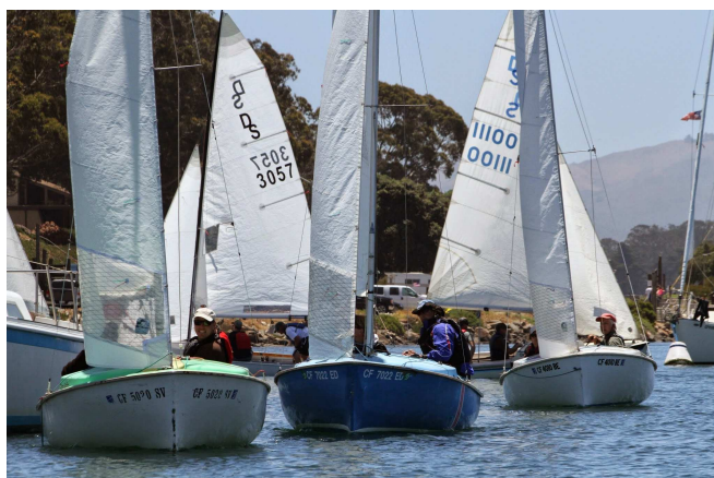
Close racing ^^^^^