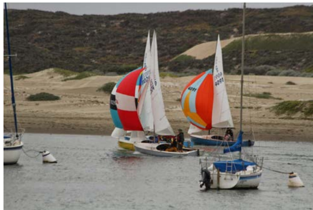
Getting passed by the Fleet—Summer I